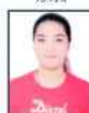
Aanam B.A. 4th Sem 72.41%