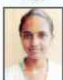
Kumkum B.A. 4th Sem 78.44%