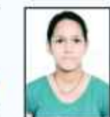
Twinkle B.A. 6th Sem 75.75%