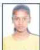
Asha B.A. 2nd Sem 71.95%