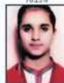
Diksha B.Com Hons 6th Sem 70.25%