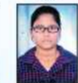
Khushi B.A. 6th Sem 72.12%