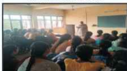
COLLEGE CLASS ROOM