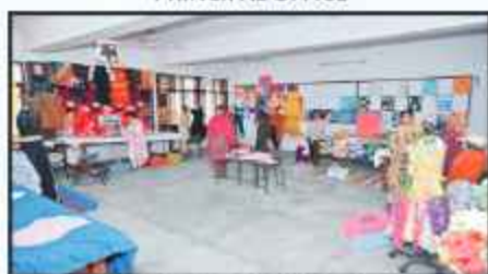
FASHION DESIGNING LAB.