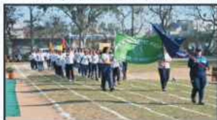
COLLEGE SPORTS GROUND